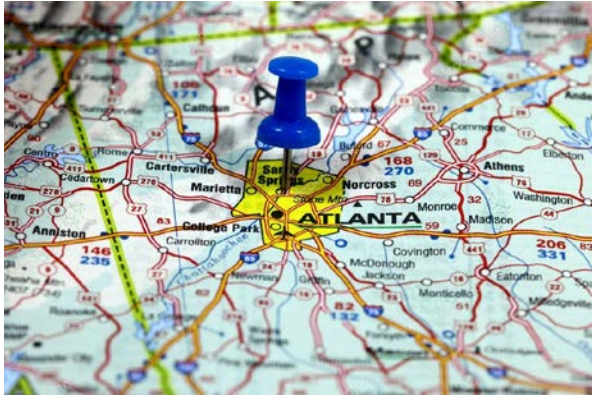
Step Up is on the move...to Atlanta, Georgia!