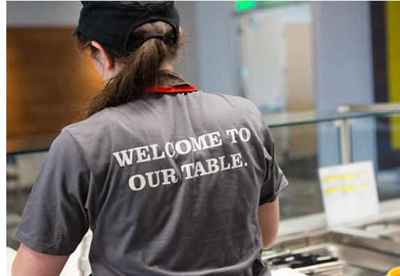
Catalyst Kitchens are leading a movement to end joblessness, poverty, and hunger in communities around the world.