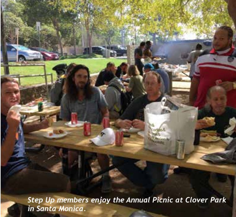
Step Up members enjoy the Annual Picnic at Clover Park in Santa Monica.