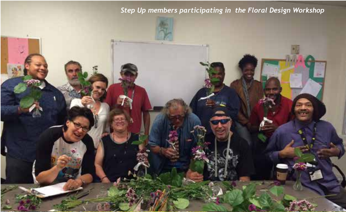
Step Up members participating in the Floral Design Workshop