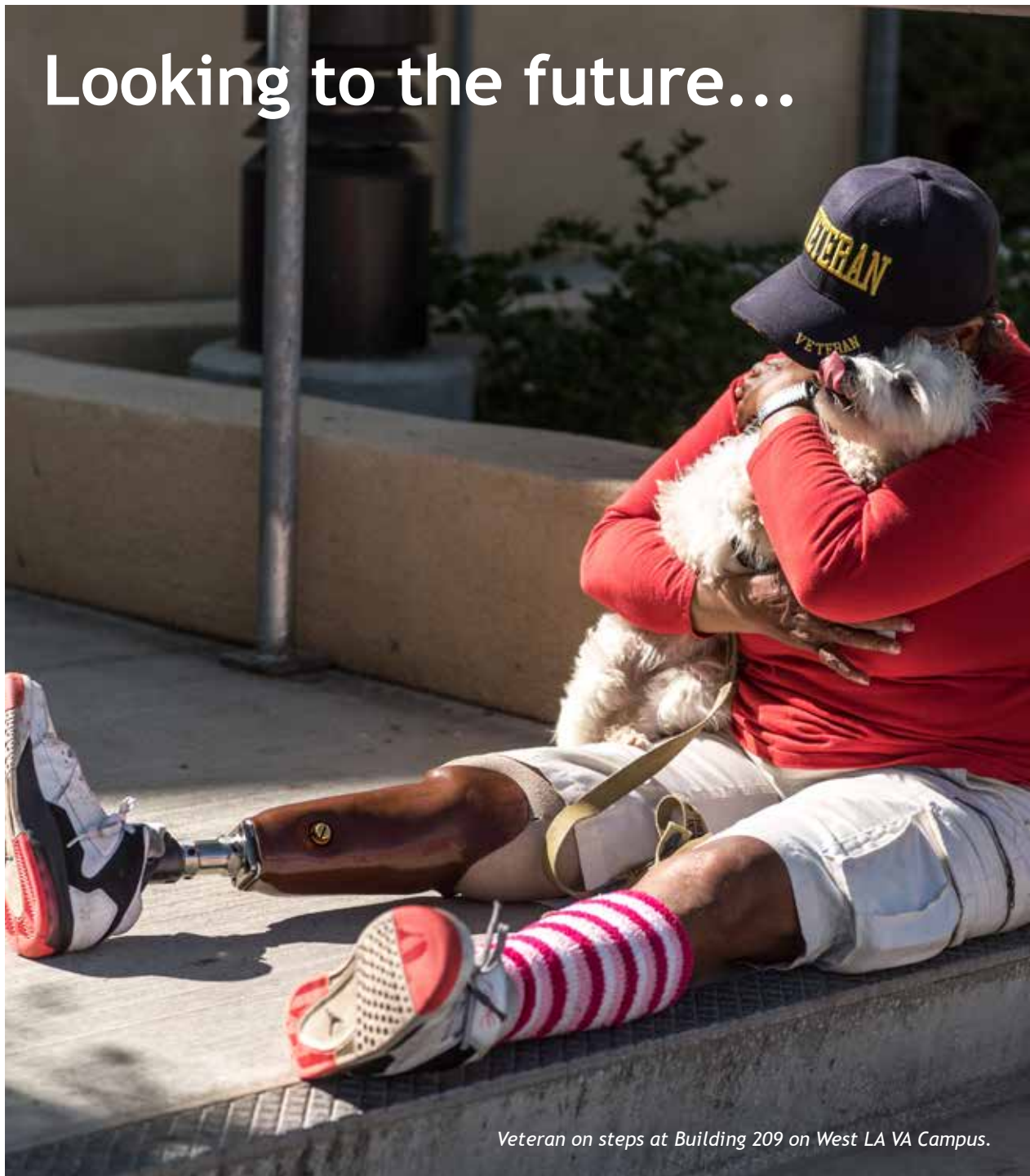
Veteran on steps at Building 209 on West LA VA Campus.